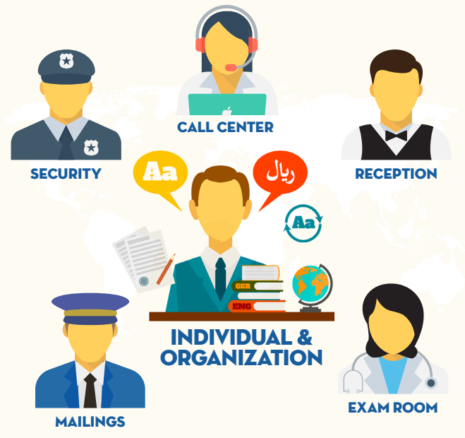
FIGURE 3: EXAMPLES OF POINTS OF CONTACT

Individuals with limited English proficiency will need language services at different points of contact within the organization, such as when they are contacting the call center, checking in with the reception desk, filling out paperwork, documenting a grievance, navigating the hallway, or paying a bill. At each point, the organization will want to ensure that its services are linguistically accessible and appropriate. Examples of points of contact are in Figure 3. Each organization should assess where individuals interact with the organization, and determine what kind of language services would be appropriate at each point of contact. The following examples describe how language access services could be provided at each point.