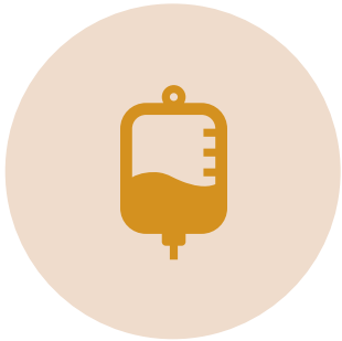
SEPSIS CRAWLER CERNER