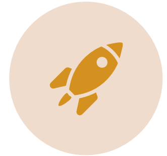
ED LAUNCH POINT